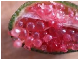
Finger Lime Red or Black

Citrus australasica - fresh vesicles have the effect of a burst of effervescent tangy flavour as they are chewed.