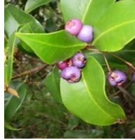
Blue Lilly Pilly

Syzygium Oleosum - When crushed, the shiny leaves give off a lovely fragrance. The fluffy, white flowers appear at varying times depending on the growing