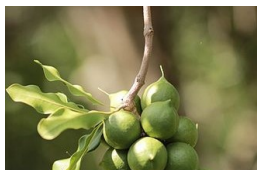
Macadamia - A4